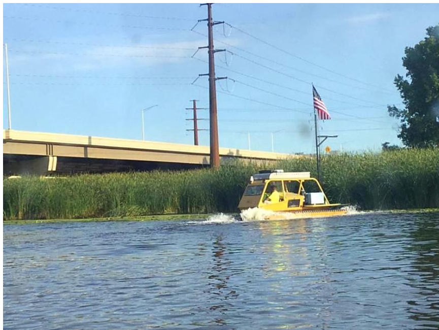
MarshMaster treating shoreland Phragmites

The Phragmites Information Hotline (920-430-0220) will be regularly updated with a recorded message about treatment schedule and progress.