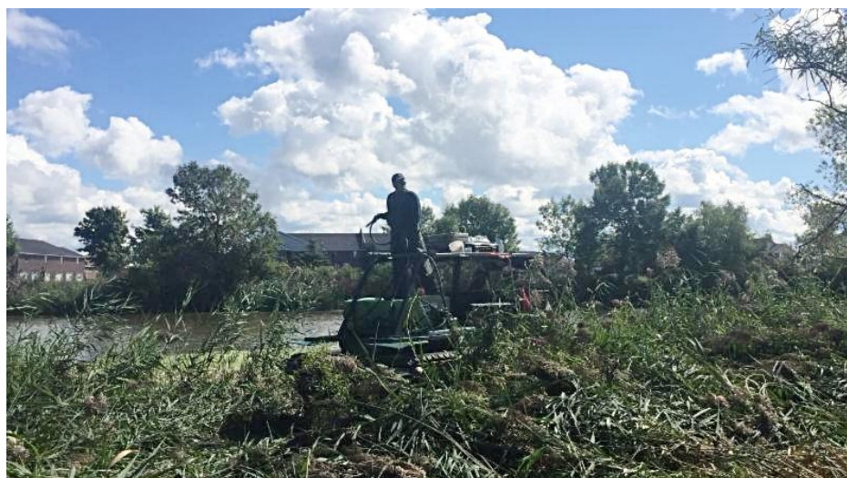
Treatments with Marshmaster in Allouez