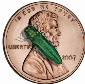
EAB on a penny

In partnership with the Wisconsin DNR, East Central Wisconsin RPC, Northwest Wisconsin RPC, and Southeastern Wisconsin RPC, the Bay-Lake Regional Planning Commission is pleased to announce the total award of $82,450 to nine Wisconsin communities for projects to mitigate the impacts of EAB. Grant funds will support planting nearly 700 diverse, non-host trees in public areas in EAB-quarantined counties within the Wisconsin Great Lakes Basin to help recover from EAB