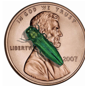
EAB on a penny

In partnership with the Wisconsin DNR, East Central Wisconsin RPC, Northwest Wisconsin RPC, and Southeastern Wisconsin RPC, the Bay-Lake Regional Planning Commission is excited to announce a new funding opportunity aimed at helping communities mitigate the impacts of Emerald Ash Borer (EAB) and prepare them for EAB invasion by diversifying their urban and community forests.