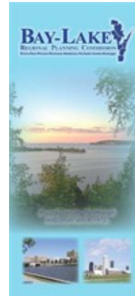
2014 Annual Report