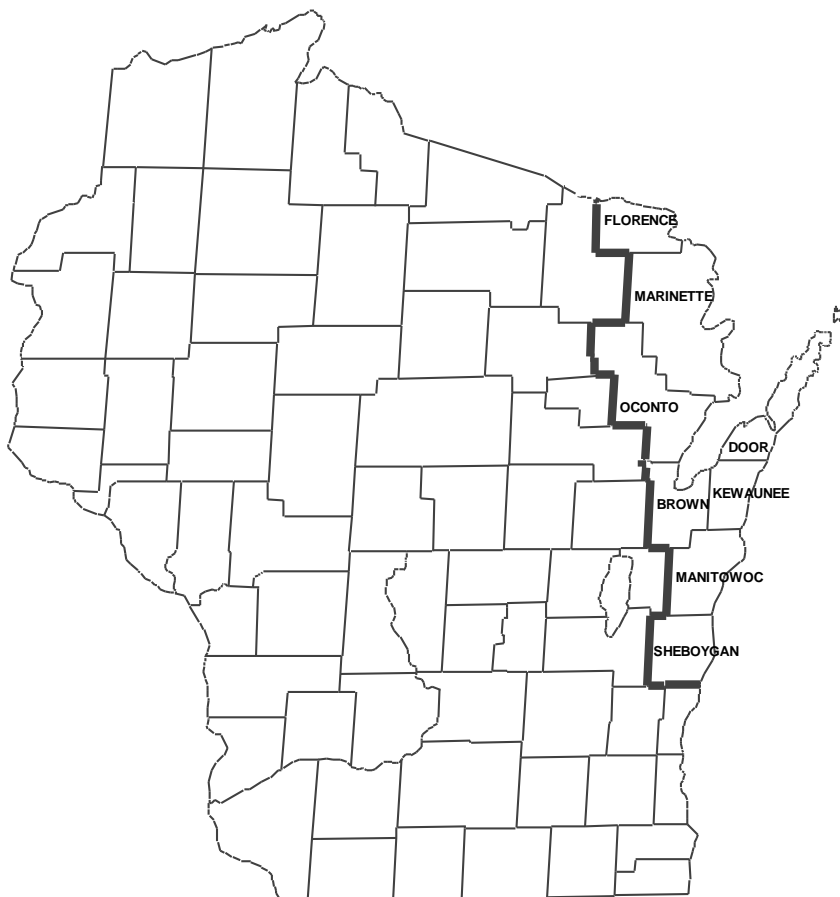
Map 1: Bay-Lake Region

The Commission serves a region in northeastern Wisconsin consisting of the counties of Brown, Door, Florence, Kewaunee, Manitowoc, Marinette, Oconto, and Sheboygan. The Bay-Lake Region is comprised of 185 units of government: eight counties, 17 cities, 40 villages, 119 towns, and the Oneida Nation of Wisconsin. The total area of the region is 5,433 square miles, or 9.7 percent of the area of the State of Wisconsin (Map 1). The region has over 400 miles of coastal shoreline along Lake Michigan and Green Bay and contains 12 major watershed areas that drain into the waters of Green Bay and Lake Michigan. The Wisconsin Demographic Services Center 2016 population estimate of the region is 587,185 persons, or 10.2 percent of the population estimate of the State of Wisconsin of 5,774,996.