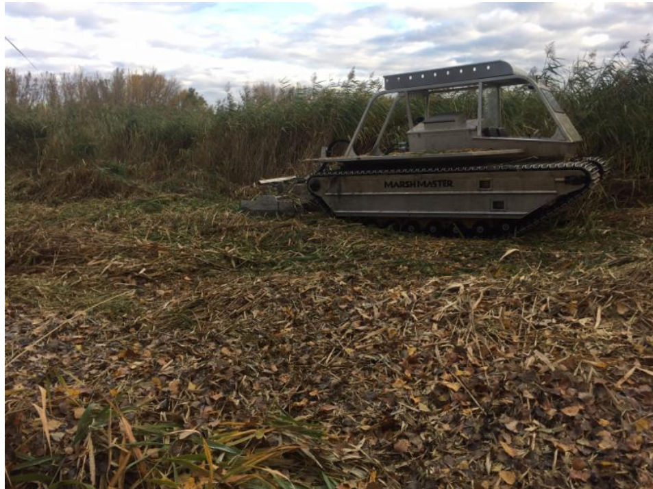
MarshMaster with Mowing Attachment

The Phragmites Information Hotline (920-430-0220) will be regularly updated with a recorded message about the treatment schedule and progress.